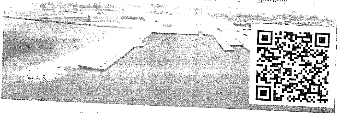
Overview of the New Casablanca Port Shipyard Infrastructure

Agence Nationale des Ports -- Direction Régulation Lotissement MANDARONA 300, Lot n°8- Sidi Maarouf, Casablanca, Maroc Tel : (212) 520 200 700 Fax : (212) 522 786 834 E-mail : NCNC@anp.org.ma